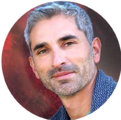
Ariel Jaenisch Ferrigno @evoluciontir www.evoluciontir.com